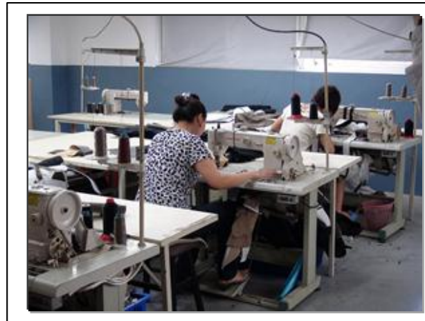
Photo from a factory in China from AMP Capital's supply chain field trip 2011.

The way a company deals with its supply chain can be a good proxy for management quality and an indication of how well it manages complexity. Potential cost savings related to the move from manufacturing in China to Bangladesh need to be balanced against additional risks in terms of brand damage, longer lead times, product quality issues and more. Further, a minimum wage that does not cover basic costs of living will not be sustainable.