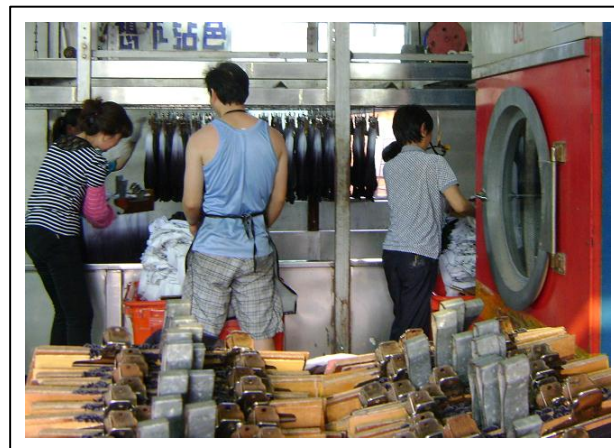
Photo from a garment washing and dyeing facility in China from AMP Capital's supply chain field trip in 2012.